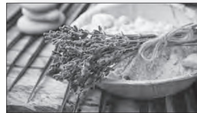
(Lavender: continued from page 2)

The festival will be open to the public on July 9 from 10:00 a.m. to 6:00 p.m. and on July 10 from 10 a.m. to 5 p.m., at the Chehalem Cultural Center (415 E Sheridan Street) in Newberg. For more information, please feel free to contact the Willamette Valley Lavender Festival at (503) 662-2141 or email wvlavenderfestival@gmail.com .